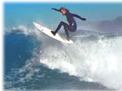
Surfing Nootka Island

Inlet. In summer and fall of 2004, Tahsis residents saw the first pioneers testing the inflow and outflow winds on the inlet.