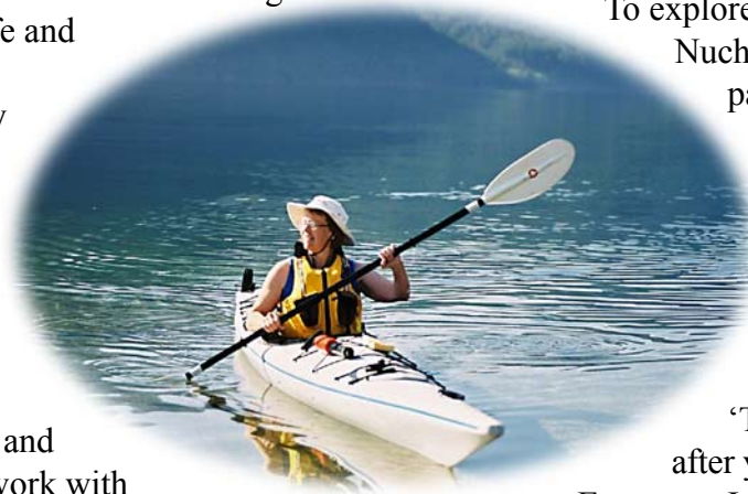
Kayaking Tahsis Inlet

There are also excellent camping spots on Catala Island and Yellow Bluff on the North Shore, but access to both requires crossing open water when the tides are good and water is calm. Fresh water is not always available at either camping spot. From Rosa or Garden point, kayaking in Mary Basin up to Ferrer Point has many advantages. There are lots of little streams, safe protected kayaking, sea otter families, eagles, bears, and marine birds. Mary Basin