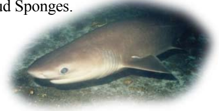
Prehistoric 6-Gill Shark

Tahsis and Leiner Rivers provide excellent snorkeling opportunities in the late summer and early fall when the Salmon return to spawn. At that time the rivers are full of Coho and Chinook, as well as the occasional Pink, Chum, and Sockeye.