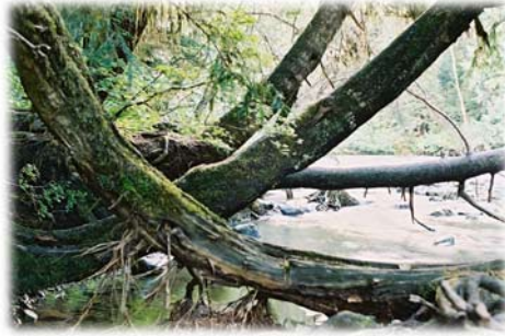
Leiner River Campsite

A short drive past the Maquinna Resort is the turnaround and parking lot for West Bay Park. There are washrooms, and stairs down to the rock beach at West Bay. This sheltered little bay is an exception to the deep waters of Tahsis Inlet; it is shallow and southwesterly facing, catching the sun and warming up to comfortable swimming temperatures. Locals frequently come down here to swim, sunbath and walk the short trails in this area.