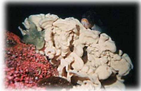
Cloud Sponge and small Rockfish

Little Espinoza Inlet has remarkable biodiversity, and is also a favoured diving spot.