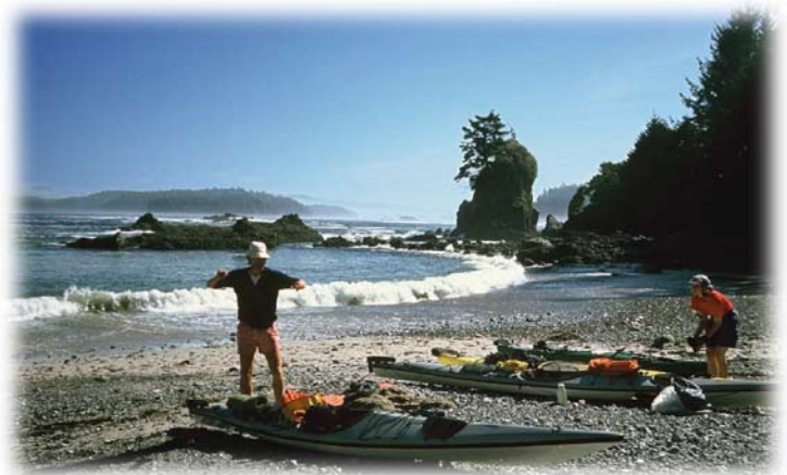
Kayaking Nootka Island