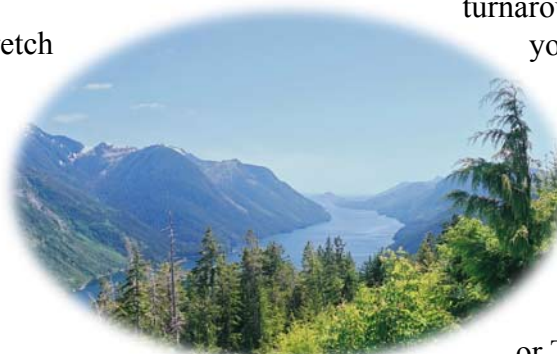
View from Lookout to Nootka

A great place to start a more extended hike is from West Bay Park, just past Maquinna Resort at the end of town. There are shorter trails accessed from the