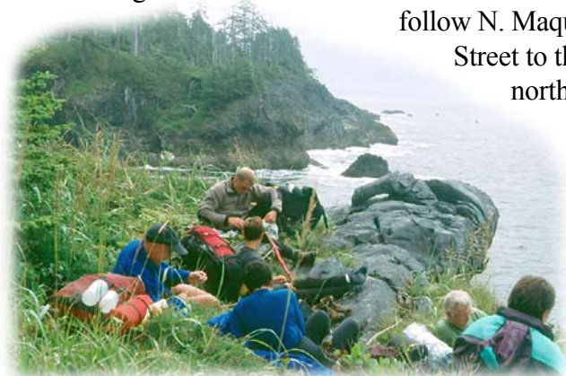
Nootka Trail - Maquinna Point

follow N. Maquinna Street to the north end of