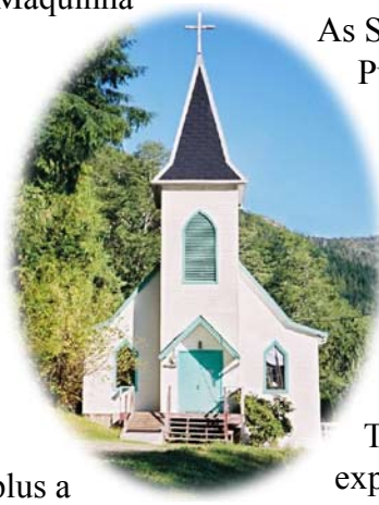
St Joseph’s Church

Park at the top of Princess Victoria View.