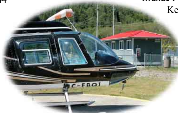
Tahsis Heliport and reception building

Campbell River Airport is serviced by Pacific Coastal Airlines and Helijet.