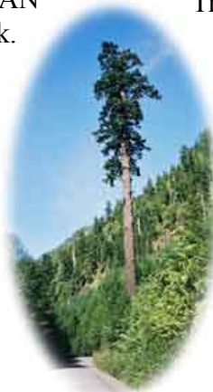
President's Tree, Tree to Sea Drive

The Tree to Sea Drive between Gold River and Tahsis is a 64 Kilometer road classified as a gravel road by the Department of Highways. The road has received extensive upgrading over the last 4 years; 25% of the road has seal coat paving. The road is 2 lanes throughout, with the exception of several one lane bridges. The road has 2 summits, at Bull Lake and one at Malaspina Lake,