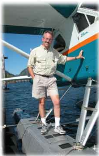
Sound Flight Pilot

Air Nootka Ltd. is a float based airline that serves the west coast of Vancouver Island. Air Nootka flies from Gold River to Kyuquot and will stop in Tahsis on request. Air Nootka offers charter services for up to 9 passengers from other areas of Vancouver Island or Vancouver.