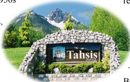
Tahsis Welcome Sign

The heliport is located next to a waterfront section popular with locals walking their dogs. There is an expansive view of the inlet, lots of marine bird life and convenient parking.