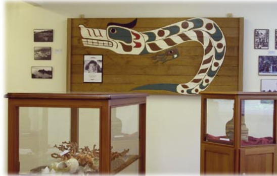
Tahsis Museum Display

The Tahsis Museum was revitalized in 2000 with a move of all the major artifacts and records into the heritage building housing the Tahsis Chamber of Commerce Info Centre. The Museum is open during the summer Info Centre hours and during special events. Entry at other times may be arranged by contacting society members through the Village of Tahsis office. They can also arrange for groups to have guided tours of Tahsis or the museum. Entry to the Museum is free, but donations are welcome and help to maintain records and exhibits.