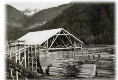
An early Tahsis lumberyard

The valley was cleared except for an exceptionally fine stand of Timber along the Tahsis River that is in the heart of the village now. The trees were felled and floated down the river right into the booming ground. The logs were sold in order to pay for the building of the new mill. The first accommodations were floating