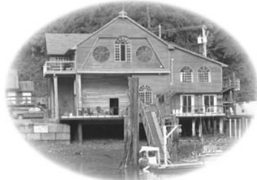
Tahsis heritage building, formerly a sawmill

The Tahsis original townsite is picturesque; the first homes in the area were float homes built in the 1940s, brought ashore and set upon timber foundations on steep mountainside streets. Stonework walls and monuments are a distinctive feature created by a local stonemason.