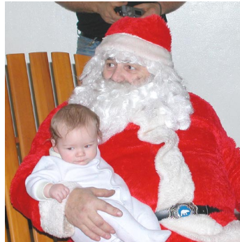
Santa and friend on a visit to the 2004 Community Dinner

Santa will be coming to town, and Tahsis is celebrating with the Annual Community Christmas Party on December 17, 2006 at 5:00 PM.